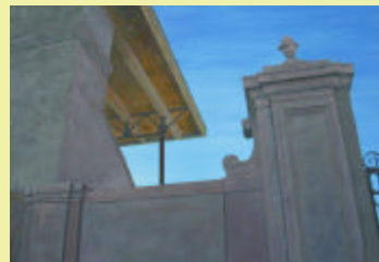
Keith Chenot Grand Stand

"Crocker Field itself is a work of art, nestled next to the river. Getting to experience it as a subject of art has been a great pleasure."