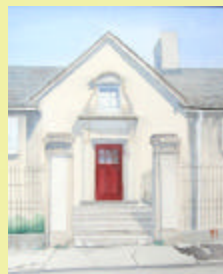
Priscilla Mavrikis-Walkerns Crocker Field House. 25 Circle Street 8:19-21)

A victory by One; cheers for the Champion...humankind, rejoice! The forerunner has gone before; Follow Him. One day, freedom! Through the lens of Roma."